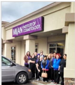
Students from the inaugural class of Milan Institute of Cosmetology, Nampa, ID.