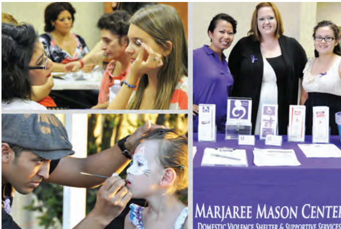
Milan Institute Clovis, California - Students, staff and guests participate in the Girls' Night Out Carnivale.

On July 21, 2012, Milan Institute in Clovis, California, hosted a fundraiser for the Marjaree Mason Center. For more than 30 years, the Marjaree Mason Center has offered shelter, crisis support, legal assistance and counseling, at no cost, to victims of domestic violence in Fresno County. The center operates the county's only domestic violence shelters.