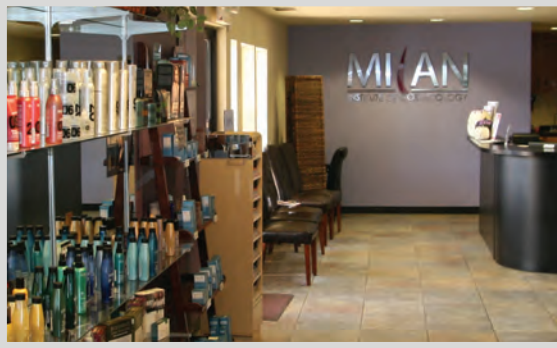
Milan Institute of Cosmetology in Visalia, CA

Milan Institute of Cosmetology began enrolling students in the Cosmetology program at the Visalia, California, location in January 2008. At the time, the student salon, classrooms and administrative offices were all located in one building. The program soon proved to be popular with local students, and in November 2009, the cosmetology classrooms and administrative offices were moved to a building across the parking lot. The school was then able to expand the student salon. In 2012, a Manicurist program was added to help better meet the needs of students within the community. Currently, over 220 students are enrolled between the two programs.