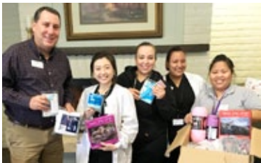
Collecting comfort items for local assisted living facilities.

http://milaninstitute.edu/student-services/student-salon-spa/