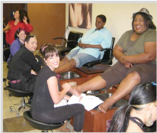
Students pamper women from Love-A-Child shelter.

On May 11, 2011, Milan Institute of Cosmetology in Concord, California, provided free services at its student salon to women from Love-A-Child Missions Homeless Recovery Shelter. For over 20 years, Love-A-Child has been serving needy women and children by providing emergency shelter, food and clothing. It offers hope through substance recovery programs, job training, educational support and many other programs. It is currently the largest recovery shelter in Contra Costa County, serving over 400 women and children annually. 20 women from the shelter were provided with free haircut, hair color and styling services performed by students under instructor supervision. Milan Institute cosmetology students were happy to provide their special guests with some much needed pampering. In addition, students hosted a potluck on the same day to provide refreshments to their clients. They also organized a clothing drive, where students, instructors and administrative staff donated gently used clothing to women and children from the shelter.