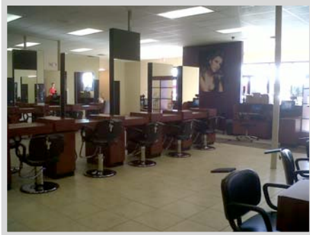
El Paso, TX Campus

The newest addition to the group of Milan Institute schools is the El Paso, Texas, campus located at 1580 George Dieter Drive, Suite 207. The school opened its doors to the El Paso community in August 2010 offering a Cosmetology (Operator License) program. An integral part of the career training program is providing students with hands-on experience. Students are required to complete a certain number of hours in a variety of techniques in the