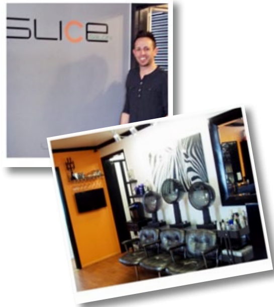
Bottom: Slice Salon Interior

For more information about our graduation rates, median loan debt of students who completed the program and other important information, please visit our website.