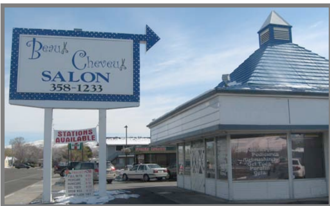
Beaux Cheveux Salon

Beaux Cheveux Salon in Sparks, Nevada, is one of the many employers of Milan Institute of Cosmetology graduates. The salon is owned and operated by Milan Graduate Sharon Childress, who was able to open the salon in March 2010, just 4 months after she completed the Cosmetology program. Beaux Cheveux caters to clients of all types. It offers a wide range of services including hair extensions, chemical relaxers, multi-tone