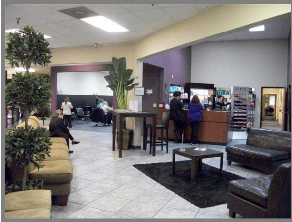
Clovis Campus Lobby

Since it first opened in December 2005, Milan Institute in Clovis, California, has graduated an impressive 969 students. Currently, 360 students are in attendance. The Clovis campus is one of the few "hybrid" career training schools, meaning it offers both allied health programs (Medical Assisting and Massage Therapy) and beauty programs (Cosmetology and Esthetician). To help provide the Cosmetology and Esthetician students