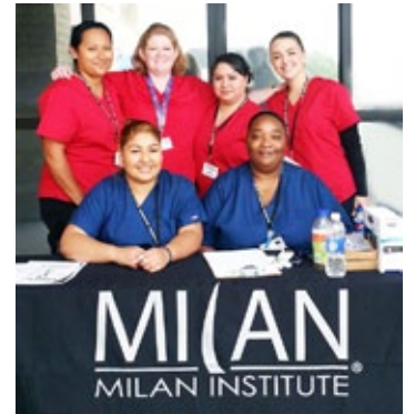
Milan Institute Clovis Medical Assisting students lend a hand during campus blood drive.