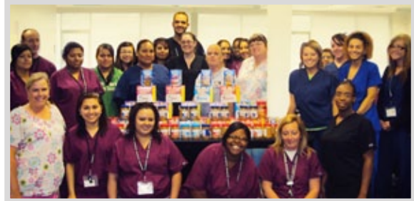
Milan Institute Amarillo students and staff with their Snack Pak 4 Kids donation items.