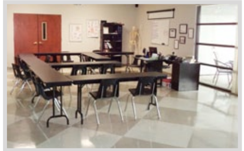
Merced, CA Campus

Merced is a dynamic community located approximately 110 miles southeast of San Francisco and 310 miles northwest of Los Angeles, with friendly small town living in a mid-size city. Situated in the heart of California's agricultural Central Valley, Merced is the region's hub for education, culture and business. Merced's location provides easy access to the central California coast, Sierra Nevada Mountains, national parks and major cities.